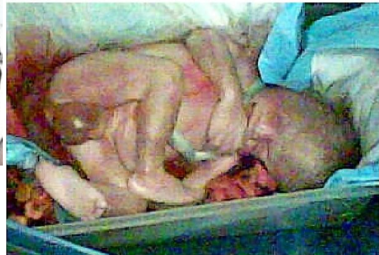
Baby Boy A